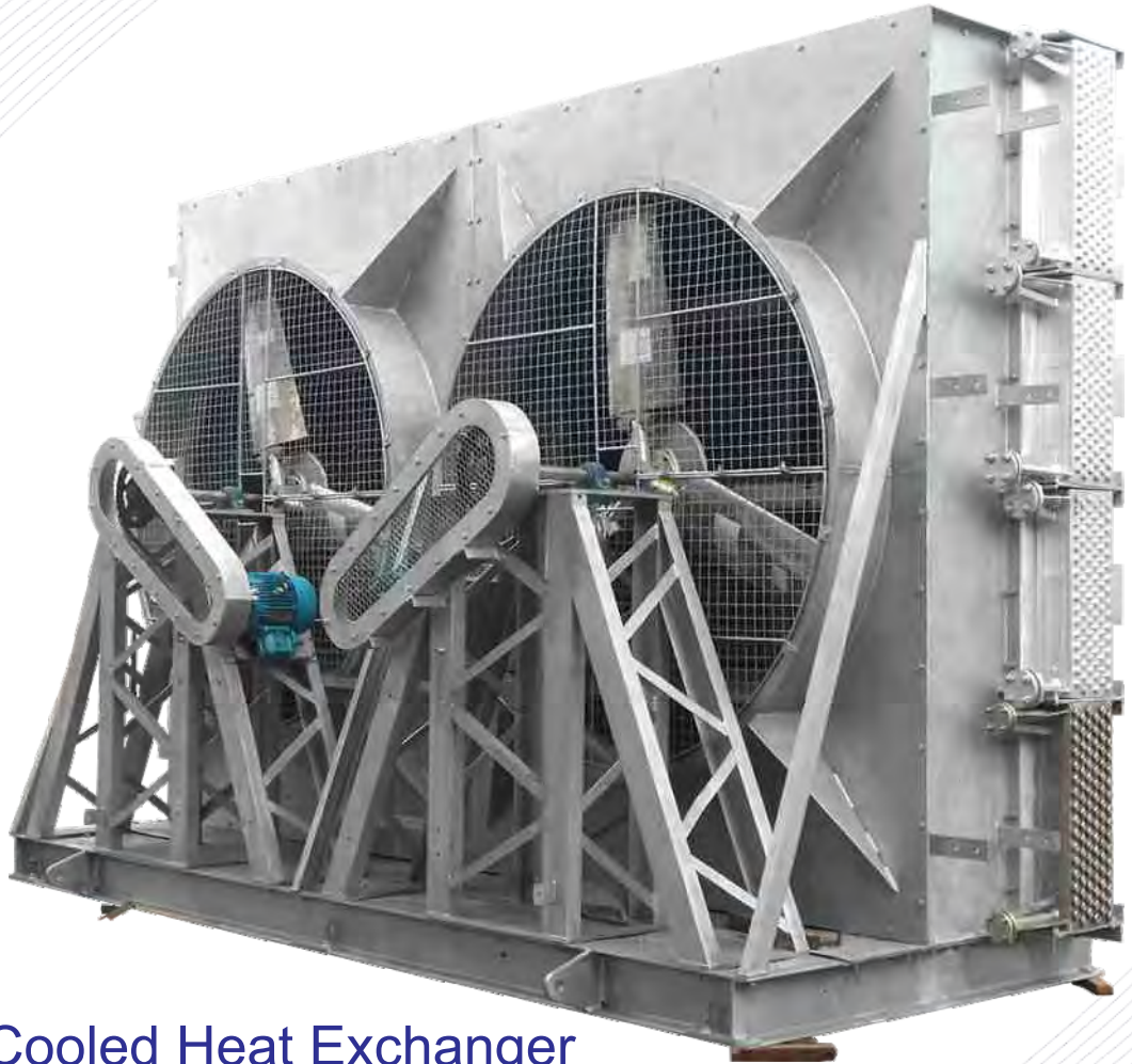
Air Cooled Heat Exchanger