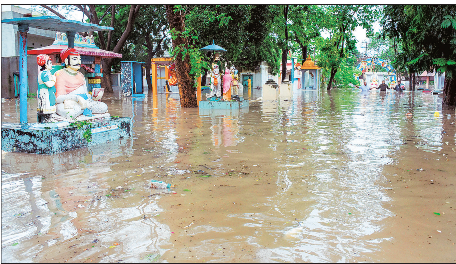
A submerged crematorium in Jamanagar on Tuesday. PTT

Both the regions, that cover nearly half of the state, have more than doubled their rainfall receipt within one week. As on June 30, the average rainfall received in Saurashtra was 22.86 per cent while Kutch received 25.17 per cent of the average rain-