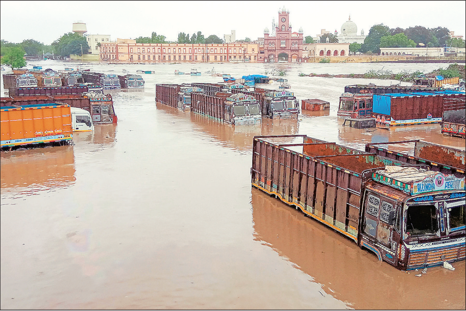
Trucks partially submerged following heavy rain in Jamnagar on Tuesday.