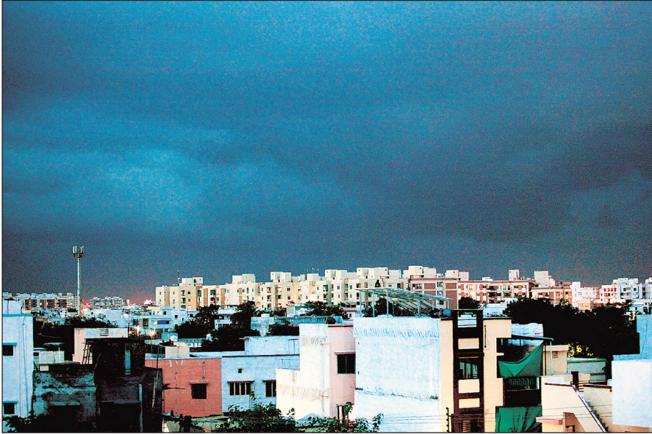
Dark clouds gather over Vadodara on Tuesday.